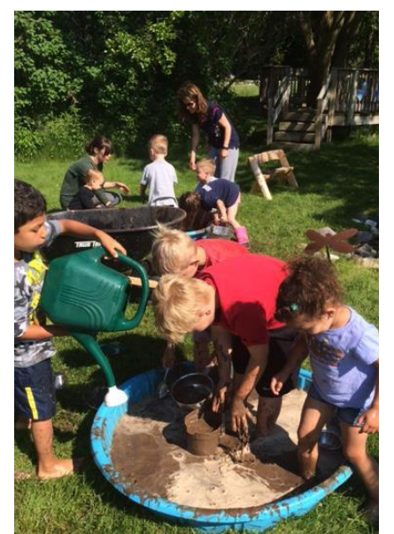
International Mud Day

Summer is a time of sunshine, fresh air, picnics and activity. Woodland Dunes provides a setting to explore nature and experience all that is summer. The season kicked off with a celebration of International Mud Day on Monday, June 29th. This was our first time celebrating the holiday and it won't be the last! Families investigated soil, painted with mud and played in the mud kitchen, complete with kiddie pools of mud, a wheel barrow of water, pie pans, spoons and more. At first, the kids daintily touched the mud with their fingers. Soon, they took off their shoes, stepped in and let the mud squish between their toes. Eventually, kids were painting their legs and arms with mud paint, plopping in the mud pools and making wonderful, muddy pies. To wash off, everyone ran through a sprinkler. It was a mudder-ific time and I look forward to next year's celebration.