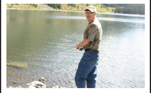
How long have you volunteered at Woodland Dunes and what made you decide to become involved?

I started bowhunting at Woodland Dunes in the early 1980's. The early years were mostly spent cutting brush and invasives; back then we had to use all hand tools. After that I helped build boardwalks, worked on the tower by Goodwin Rd., worked at fish fries and spaghetti dinners and helped in the office mailing pamphlets. The hunting opportunities introduced me to Woodland Dunes. I continued to be active with the organization because I like anything involved with the outdoors and helping with nature.