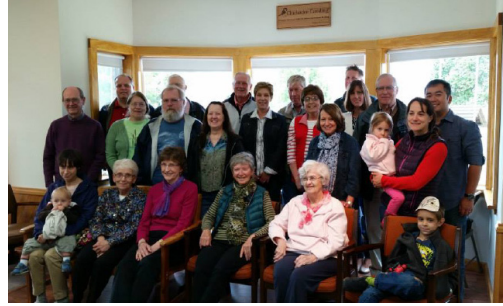
Thank you to the Alyea family for making our bird viewing area possible

Even with the weather being a little chilly this year, Bird Breakfast and the Grosbeaks Galore Workshop was a lot of fun! About 100 people attended overall and enjoyed a ham and pancake breakfast sponsored by Browns of Two Rivers, coffee and a free sample of mixed bird seed from SeedsNBeans, on-going kids' activities, nature hikes, free native shrub or tree, and bird banding demonstrations. Thank you to all of our volunteers that made this day possible!