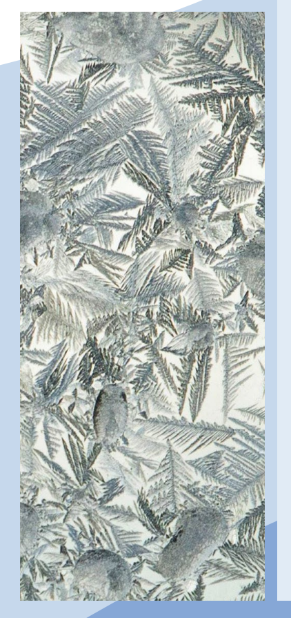
Photography by Nancy Nabak unless otherwise noted.