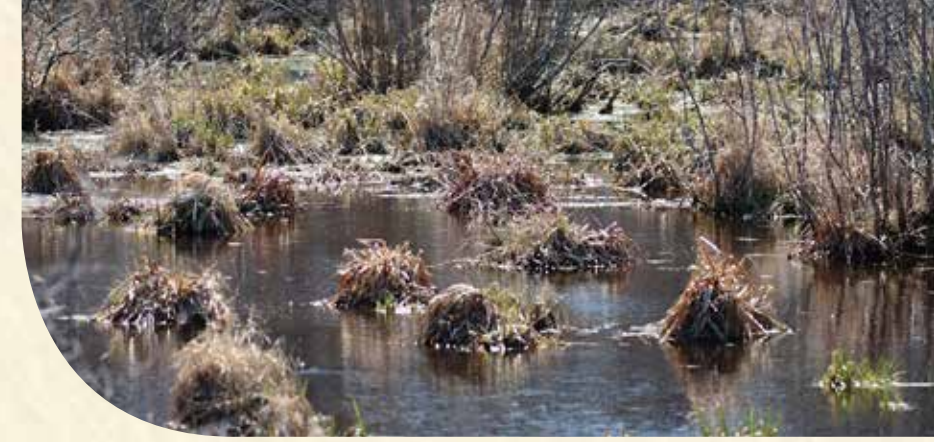
Swale water levels in May 2023