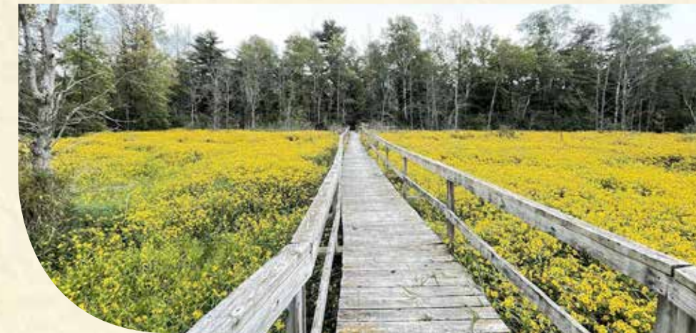
Swale with Bidens Bloom Sept 2023