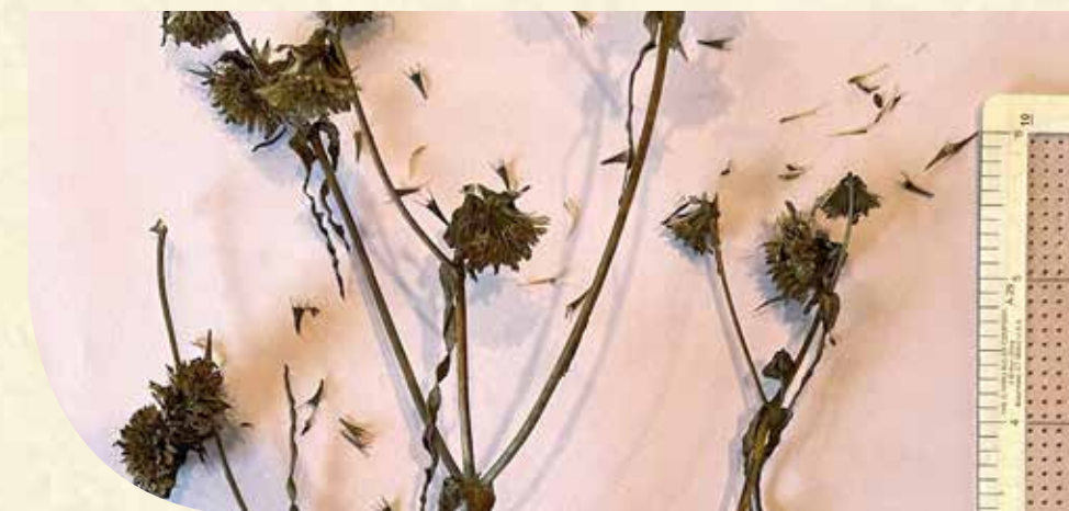
Bidens fall plant specimen Nov 2023