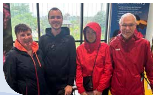
Visitors from Germany enjoying the Dunes this summer.

Thank you to Cellcom for supporting and upgrading our trails with a gift of $500. Note: Cellcom no longer has a store front in Two Rivers, but if you'd like to drop off a used phone to be recycled, you can bring them to Woodland Dunes.