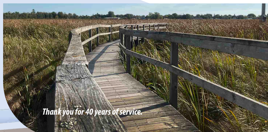
Thank you for 40 years of service.