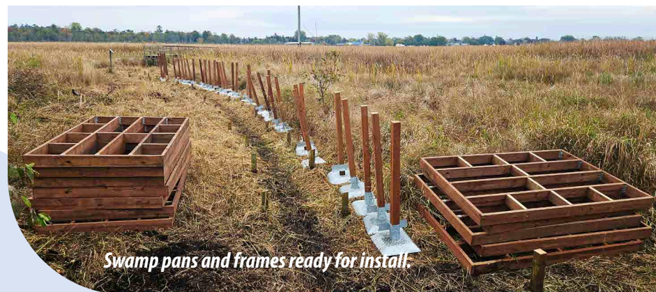
Swamp pans and frames ready for install.