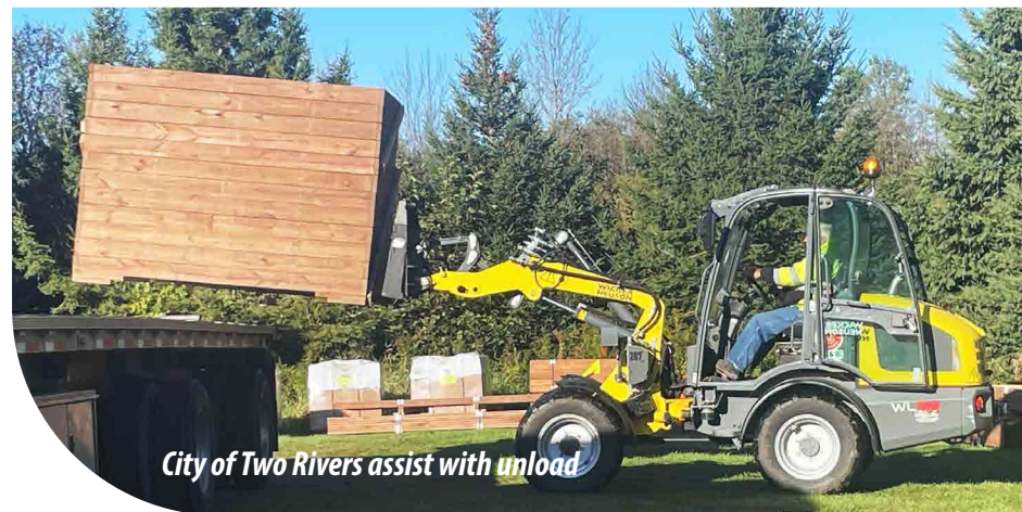
City of Two Rivers assist with unload