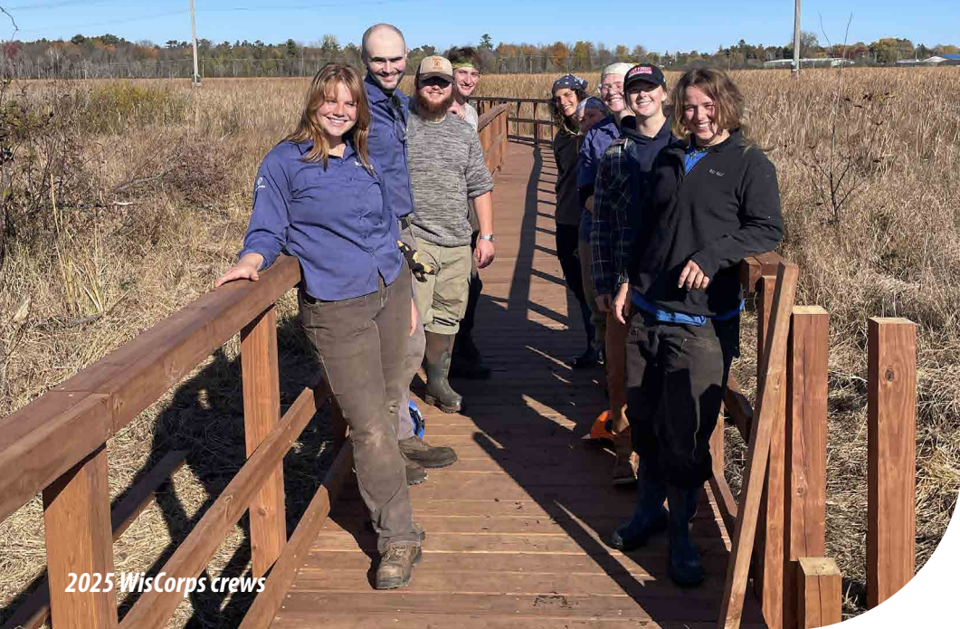
2025 WisCorps crews