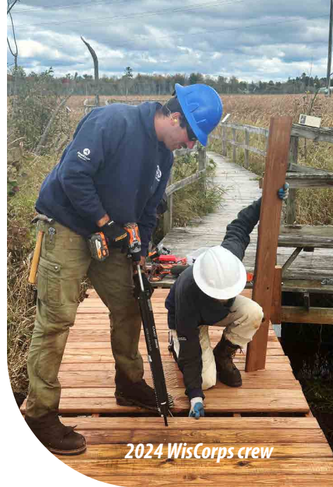
2024 WisCorps crew